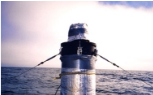
Construction that hold the camera, battery and PIP6

A Sony DAT tape backup system is also attached externally using the SCSI-II interface.