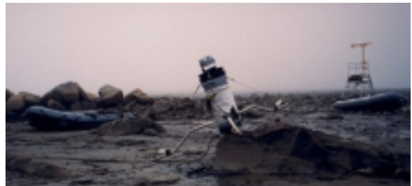
View of the complete construction